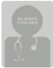
Craig A Coleby, MD

Wasatch Pediatrics 5770 South 250 East Suite 290 Murray UT 84107 Phone: 801-747-8700